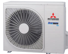
SRC20ZSX-W, SRC25ZSX-W, SRC35ZSX-W, SRC50ZSX-W1, SRC60ZSX-W1