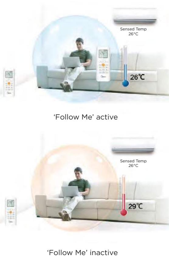
'Follow Me' active

Voice Control available by Alexa & Google Assistant.