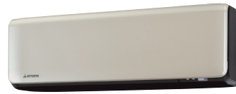
Titanium & Black(-WFT)